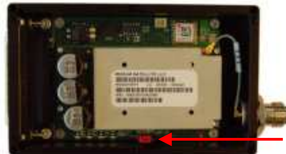
Red jumper used to set input voltage range