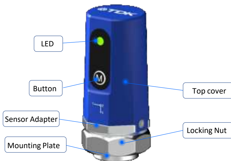
Figure 1 CBM edgeRX Sensor overview

TDK CN2202 all-in-one sensor node has powerful environmental detection and perception functions. It can monitor the temperature and humidity, light intensity, air pressure, and sound of the surrounding environment, it can also sense the vibration of objects. After the sensor node collects the data, it will upload the data through Bluetooth Low Energy. The data can help you analyze for predictive maintenance and condition monitoring.