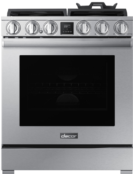
DOP30T840GS/DA - Silver Stainless, Natural Gas/Liquid Propane