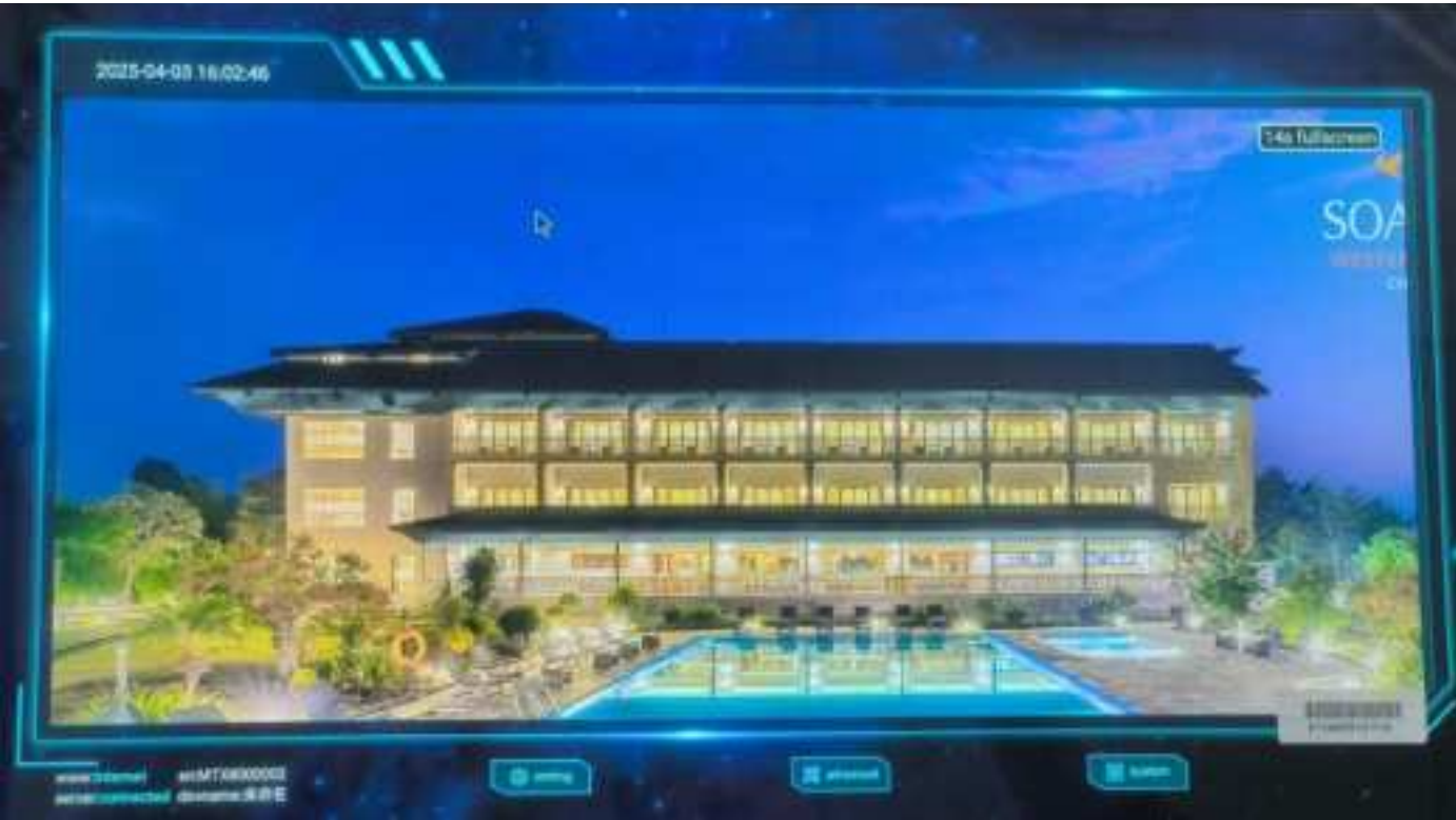
4.2 Click the setting key to enter this interface;