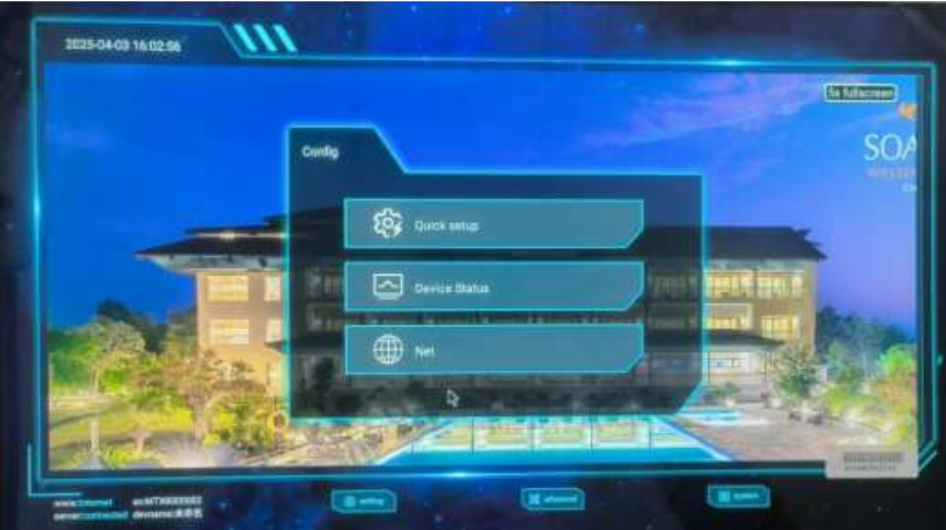
4.3 Click the Net key to enter this interface;