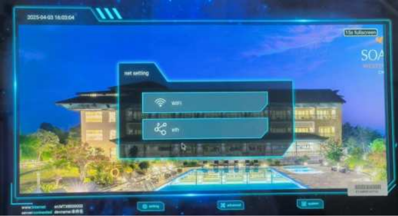
4.4 Click the WIFI button to enter this interface;