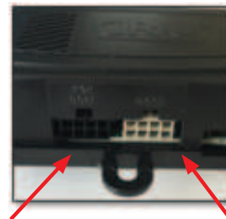
NON BOSE (Non-Amplified) Connection

If the vehicle is NOT equipped with a factory amplified system, plug in the male 8-pin connector to the BLACK female 8-pin on the SWRGM-49 module.