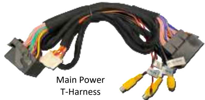
Main Power T-Harness