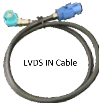
LVDS IN Cable