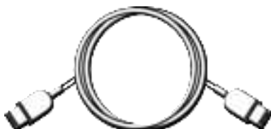
2. USB-C to USB-C Cable