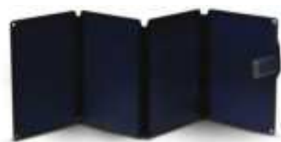
1. Foldable Solar Panel 36W