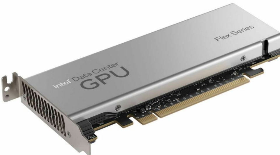
Figure 1. ThinkSystem Intel Flex 140 12GB Gen4 Passive GPU

The Intel Data Center GPU Flex 140 suitable for workloads that involve lighter AI models, such as simple object detection. Due to the higher number of video engines, the Flex Series 140 GPU can support a high number of streams.