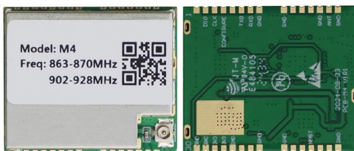
Figure 1-1 Appearance of the M4

M4 is a built-in transceiver LORA radio station developed specifically for the lawn mower market and iot wireless transmission applications. The product supports the 868MHz and 915MHz ISM unlicensed frequency bands and features compliance with radio usage regulations in Europe and the United States, frequency hopping anti-interference, long-distance two-way communication, relay networking, OTA radio firmware upgrade, etc. It meets the demand for wireless communication in the lawn mower market.