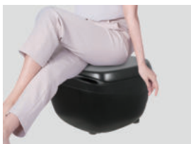
Opt.1 Warm ottoman seat