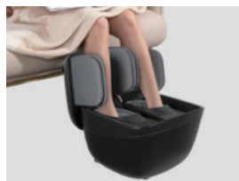
Opt.2 Foot and leg massager