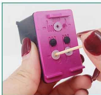
3, add ink before inserting a toothpick into the cartridge to test the colour, to prevent the ink caused by mixed colours