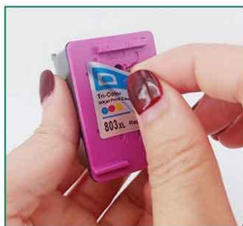
1, remove the printer inside the cartridge tear off the label, you can see the ink hole