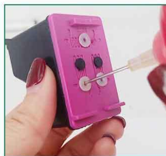
4, according to the corresponding ink cartridge hole into the ink