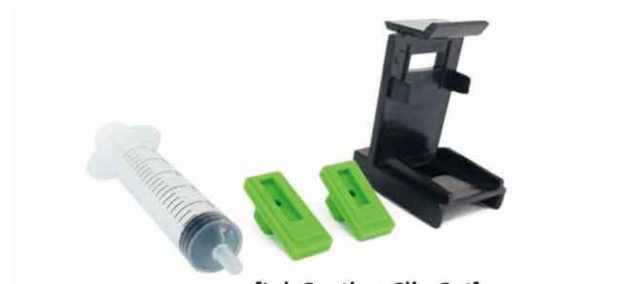
[Ink Suction Clip Set]

Ink cartridges add ink, if the print does not come out, this time should be the ink cartridge internal bubbles need to use the suction clip to suck out the ink, discharging the internal air