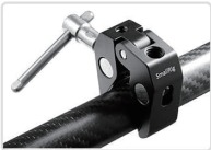
Mounts on rods