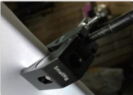
Mounts on table