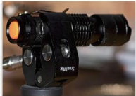
Mounts with flash