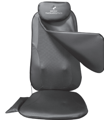
Shiatsu & Rolling Back Massager