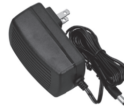
12V home adapter