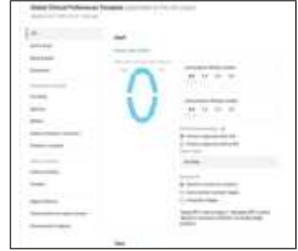
Template editor example view

➤ Practice in the Template editor demo mode and explore the customization options.