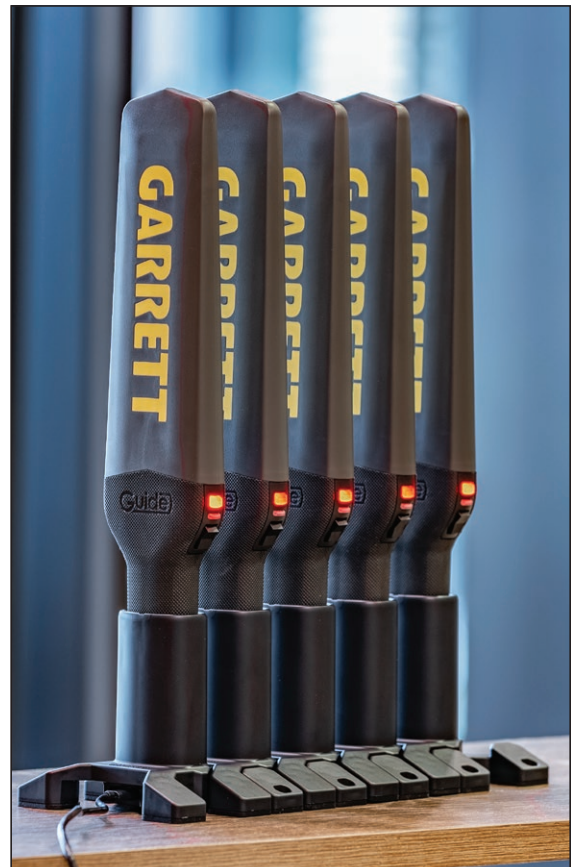
Note: Garrett Guide charging base not included