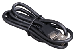
USB-C charging cable included