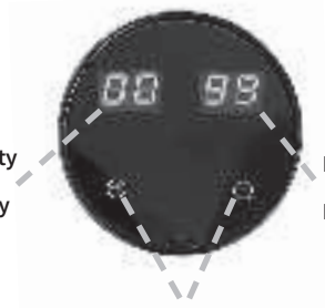
Intensity Level Display