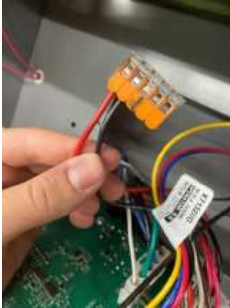
Figure 7: T1 wire connection