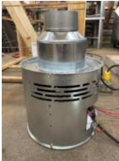
Figure 2: CAS-34U unit