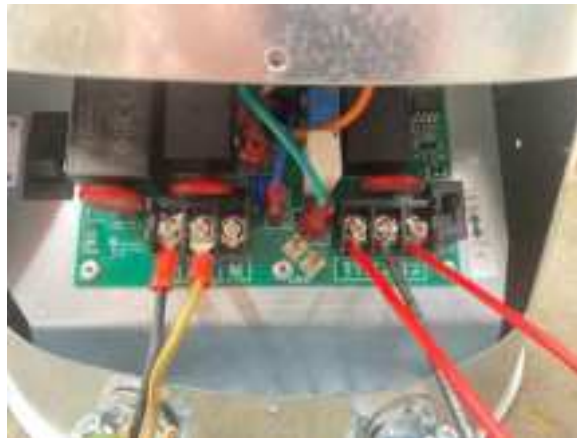
Figure 5: CAS-34U wire connections