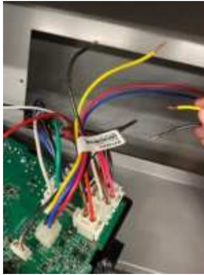
Figure 4: Wires to cut