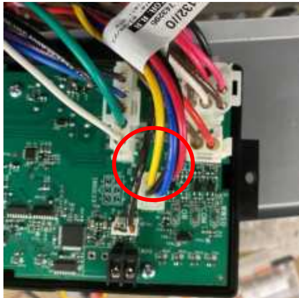
Figure 3: Vent damper wiring location