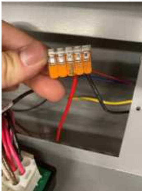
Figure 8: T3 wire connection