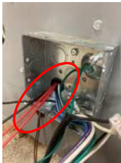
Figure 6: Run wires through hole in junction box