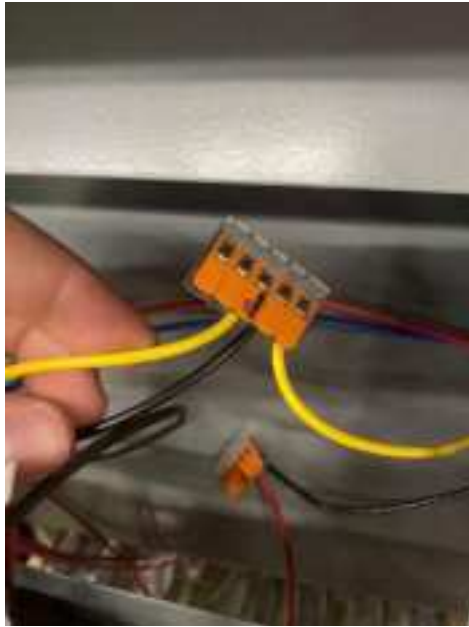
Figure 9: T2 wire connection

After all wiring is connected and there is a call for heat, the CAS-34U unit should turn on and the vent damper should open. The fan will stay on as long as the boiler is firing and turn off when the call for heat ends. There is a blue light on the CAS-34U board that indicates that the fan has power. This light will stay on regardless of if there is a call for heat or not. Place the cover back on the CAS-34U to shield the internal wiring.