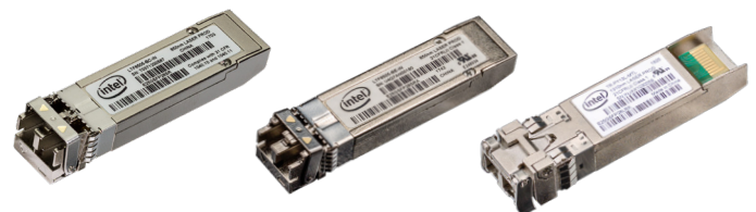
Intel® Ethernet SFP28 Optics (SR, and SR and LR extended temp)