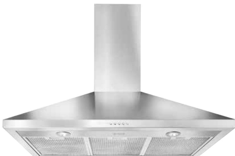
Pictured: IVG901/X1 - 90cm Canopy Hood

ILVE's range hoods are designed to stealthily keep your kitchen fresher and cleaner. ILVE range hoods craftily stand above the rest. Their powerful fan removes cooking odours, smoke and vapour from the kitchen, while extremely fine filters trap all grime. In-built LED Lights produce a natural brightness, illuminating your cooking area while the streamlined electronic control panel ensures whisper quiet air extraction is at your fingertips. Either as a visual focal point or discreetly integrated, it is easy to see that ILVE Rangehood's are built to extract!