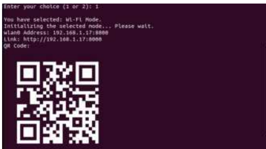
Figure 7. X-LINUX-RBT1 connection info screen

After scanning the QR code on the mobile device, the Remote Control Interface opens (provided the device is connected to the same network as the board).