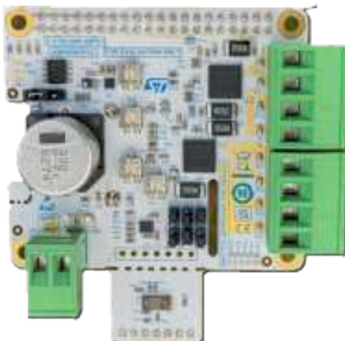
Figure 3. X-STM32-RBT01 board

The key STMicroelectronics components available on this board are described below: