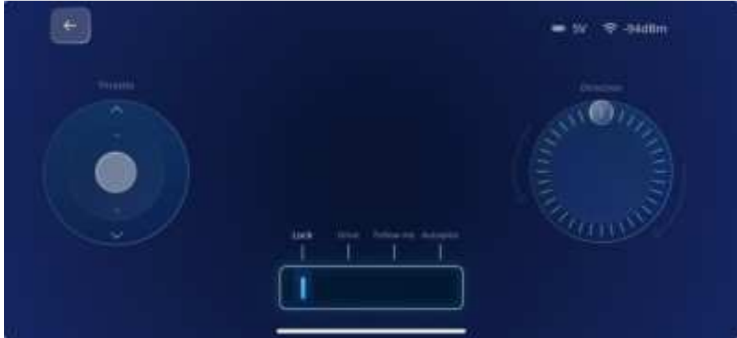
Figure 8. Remote interface

To control the rover remotely, the remote control web app is hosted through the embedded web server module of the X-LINUX-RBT1 software. Once the application is running, a URL is provided for accessing the web app. The URL is also presented as a QR code to open the URL on a mobile device for user convenience.