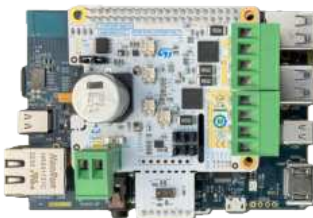
Figure 4. X-STM32MP-RBT01 with STM32MP157F-DK2

The X-STM32MP-RBT01 board can be plugged into the 40-pin connectors available on STM32MP discovery boards or Raspberry Pi, as shown below.