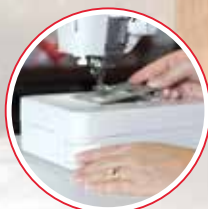
One-Step Needle Plate Conversion