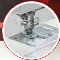
AcuFeed™ Flex Layered Fabric Feeding System