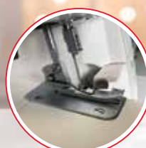
8-Piece Feed Dog for Improved Feeding