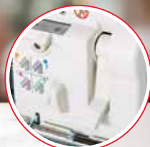
One-Push Blast Air Threading System