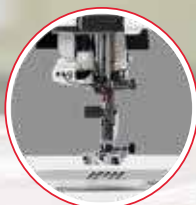
Superior Needle Threader 2