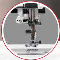
Superior Needle Threader 2