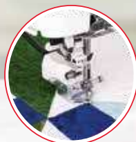
A.S.R.™ (Accurate Stitch Regulator)