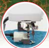
A.S.R.™ (Accurate Stitch Regulator)