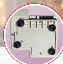
Hanenite Rubber Feet for Reduced Vibration