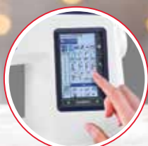
Touch Screen with 13 Languages