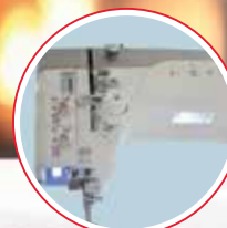
High-Intensity LED Lighting