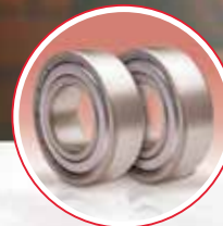
Ball Bearing Main Shaft