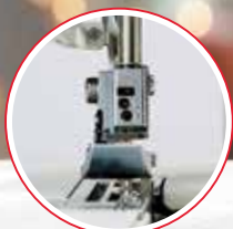
Built-in Needle Threader