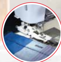
9 One-Step Buttonholes