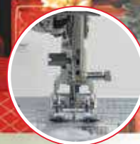
AcuFeed™ Flex Plus Fabric Feeding