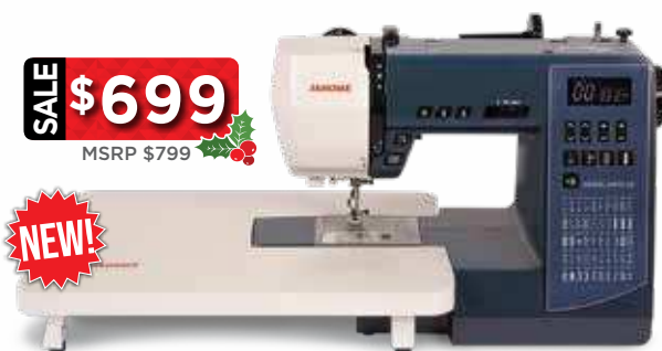
TRAVEL MATE 50