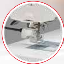
A.S.R.™ (Accurate Stitch Regulator) Compatible (Optional)