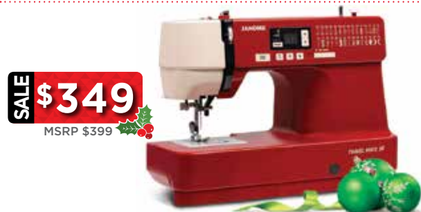
TRAVEL MATE 30