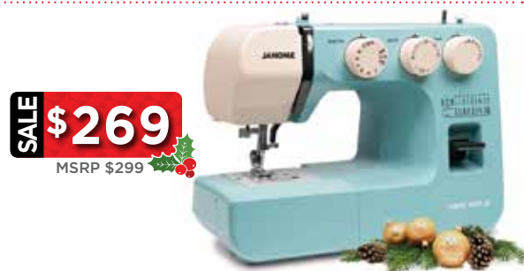
TRAVEL MATE 16