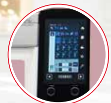
Hi-Definition 5" LCD Color Touchscreen