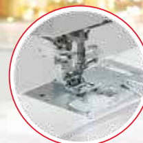
AcuFeed™ Flex Layered Fabric Feeding System