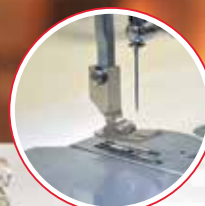
Industrial-type Straight Stitch Only Feeding