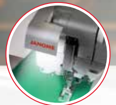
Built-in, Retractable LED Light