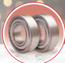
Ball Bearing Main Shaft