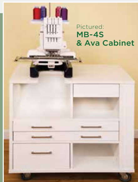
Pictured: MB-4S & Ava Cabinet