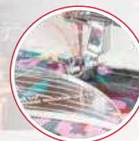
Ruler Quilting Function