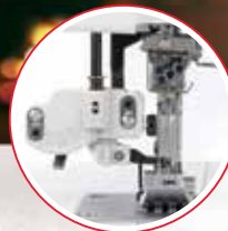
Built-in Needle Threader