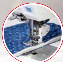
AcuFeed™ Flex Fabric Feeding System