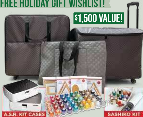
A.S.R. KIT CASES