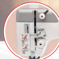
Heavyweight Thread Guide (HWTG)