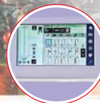
7" Color LCD Touchscreen