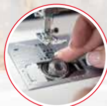
Easy Set Bobbin