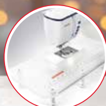
Extra-wide Extension Table Included