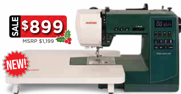
TRAVEL MATE 200

With Janome's stylish Travel Mate Series , now you can take your quilting and sewing passion with you everywhere you go.