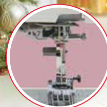
Enhanced Superior Needle Threader 2