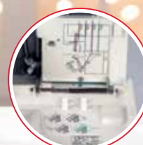
Color-Coded Thread Guides & Easy Threading Lower Looper