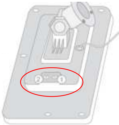
Mode Switch Button On/Off Button