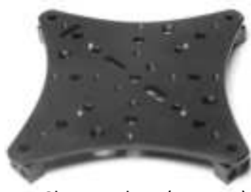
Cheese Plate (Bottom)