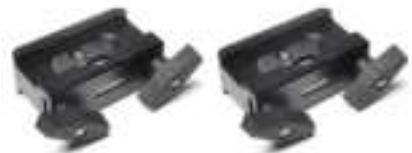
2 x Clamps