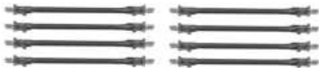
8 x Elastic Tubes