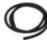
1mtr Elastic Tube