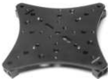
Cheese Plate (Top)

Please inspect the contents of your shipped package to ensure you have received everything that is listed below.