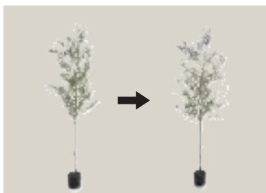
3. Flare out leaves for a more natural look.