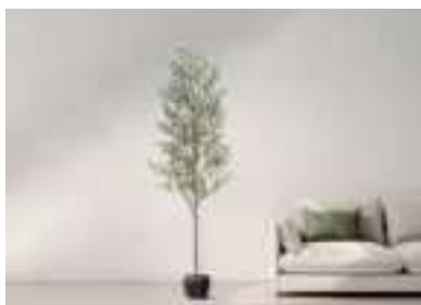
4. Place plant anywhere to liven up the room!