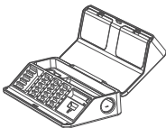
Storage case x 1