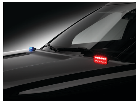
MPS652-BW and MPS652-RW Mounted on Hood