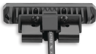
MPS652 Grille/Hood Mount Model