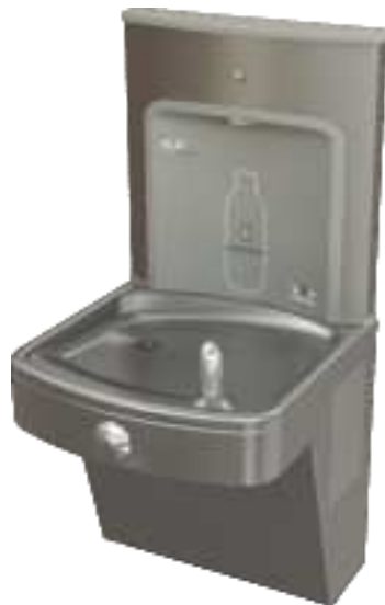
Model A171400F-UG-VR-BF11 Shown