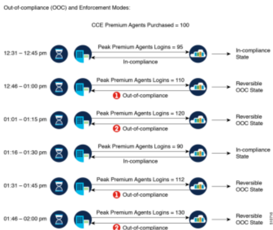
Figure 3: License Computation

In the example, the Product Instance is back to In-compliance state after two instances of overage. The next time the Product Instance goes Out-of-Compliance, the count will be 1 of 5. So, you get 45 min (after the first Out-of-Compliance notification from Cisco SSM) to bring back the consumption within the acceptable range to stay in the In-compliance state.