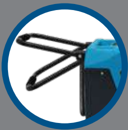
Rigid Handle Design