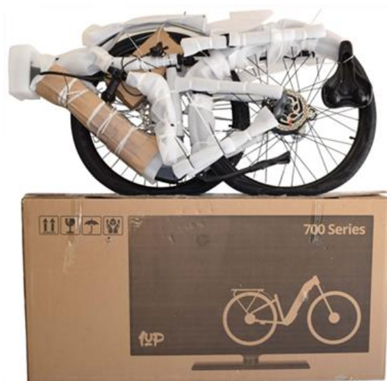
Figure 1: Bike; fork, front wheel, front axle skewer, front fender, rear rack, handlebars, saddle, and additional box of parts/tools (Figure 2) all zip tied together and padded.