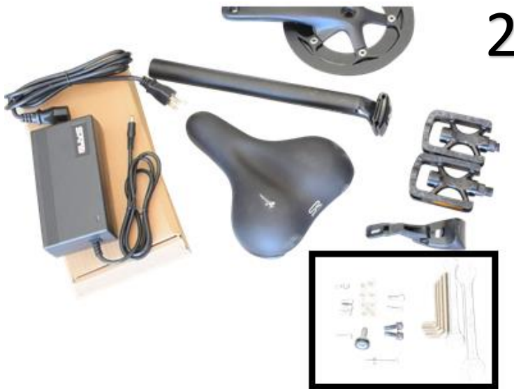
Figure 3: Close up of the bag of nuts and bolts.