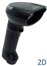
MS852DPM ESD 2D Imager Barcode Scanner