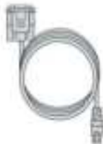
Console Cable x1