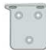
Mounting Bracket x2