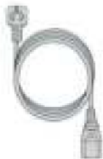
Power Cord x1