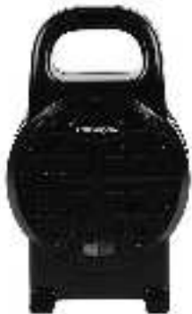
ESWM02: 5" DIAMETER