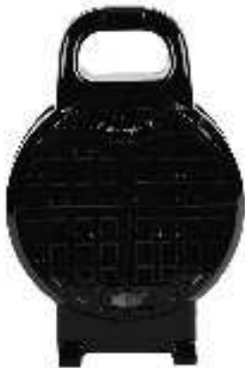
ESWM03: 7" DIAMETER