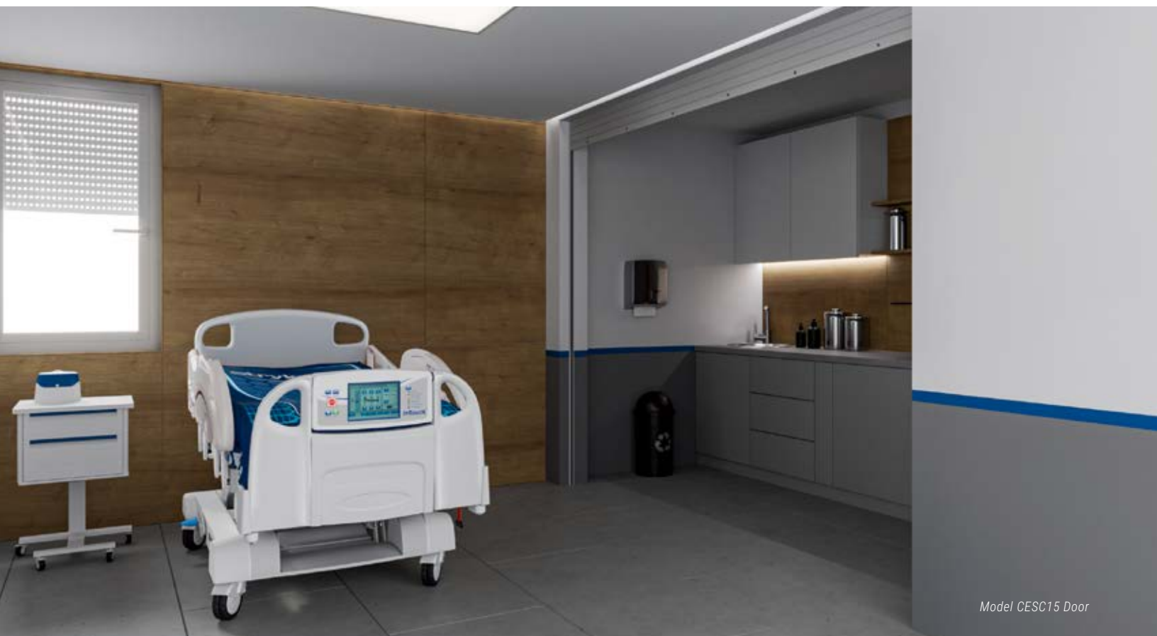
Model CESC15 Door