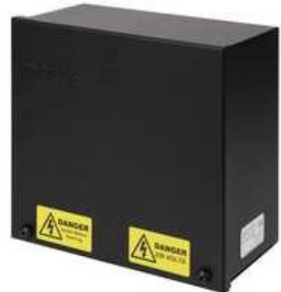
*UNIT ALSO AVAILABLE IN WHITE

The matt:e SP-EVCP-T technology does not require earth rods or measuring electrodes to function correctly.