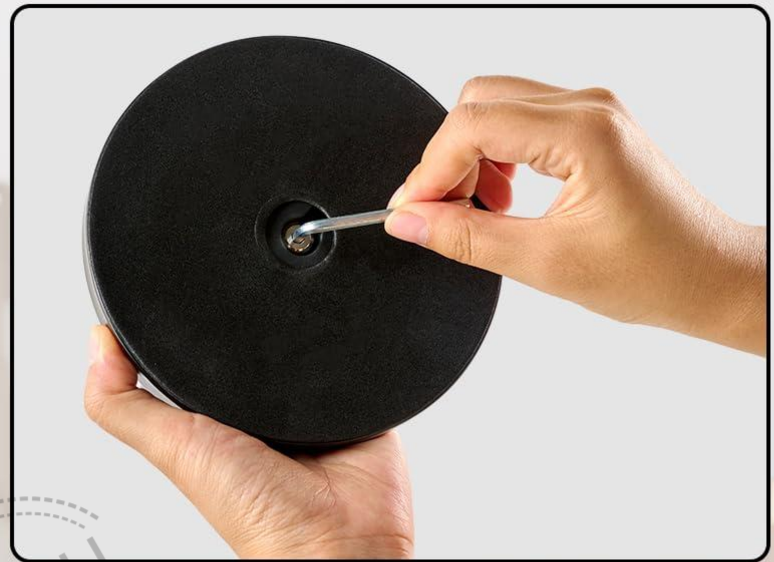
2.ATTACH THE POST BY TURNING THE NUT AT THE BOTTOM.