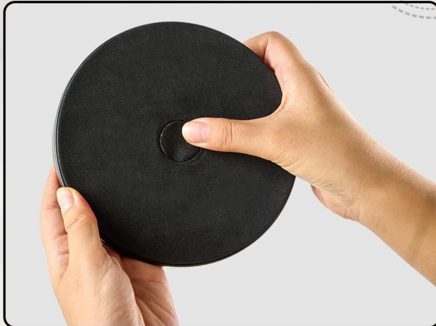
3.ATTACH THE STICKER.