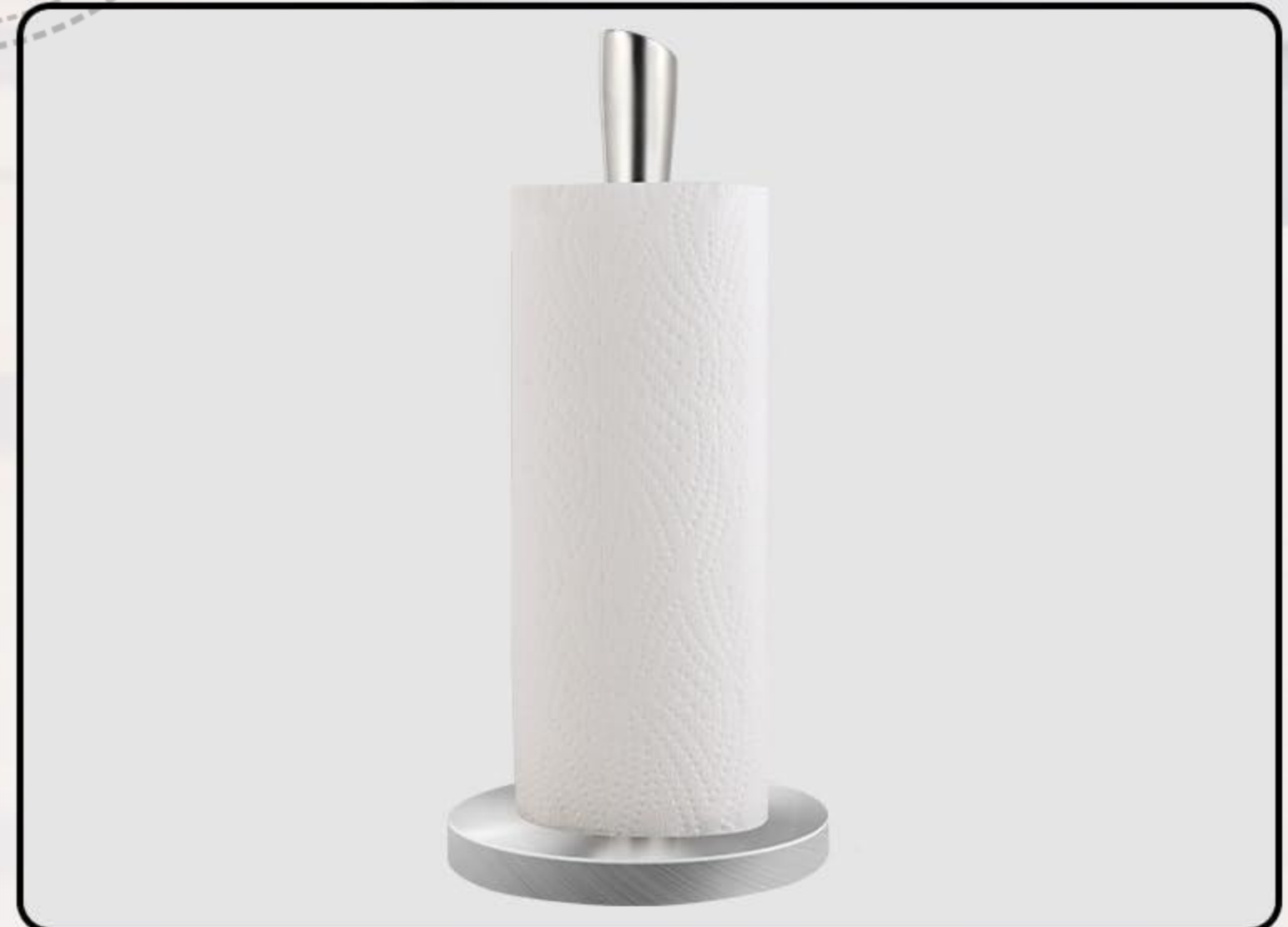
4.COMplete the installation.