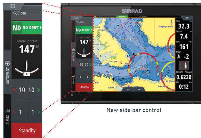
New side bar control