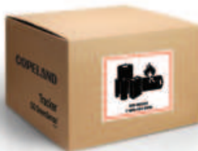
Box displaying lithium_ion battery warning