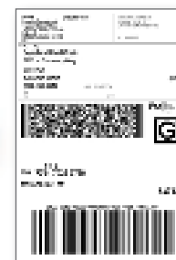
Pre-paid FedEx label