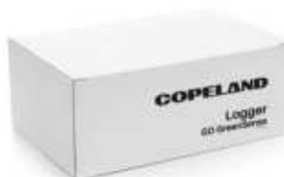
Logger shipping box