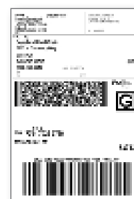
Pre-paid FedEx label