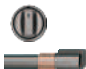
CXFCGHKPMBT Brushed Black 2 handles; 6 knobs