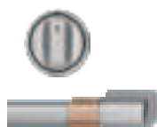
CXFCGHKPMSS Brushed Stainless 2 handles; 6 knobs