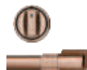
CXFCGHKPMCU Brushed Copper 2 handles; 6 knobs