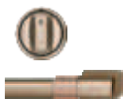
CXFCGHKPMBZ Brushed Bronze 2 handles; 6 knobs