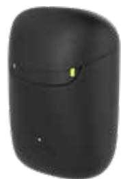
Smaller, portable charger provides 3 extra charges.