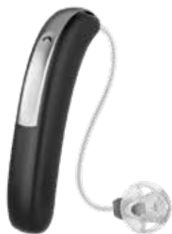
Black & Silver