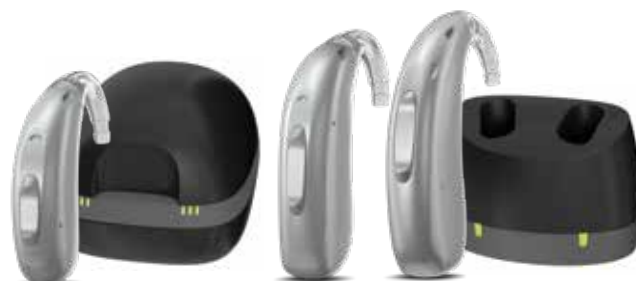
M-Core B-Li M