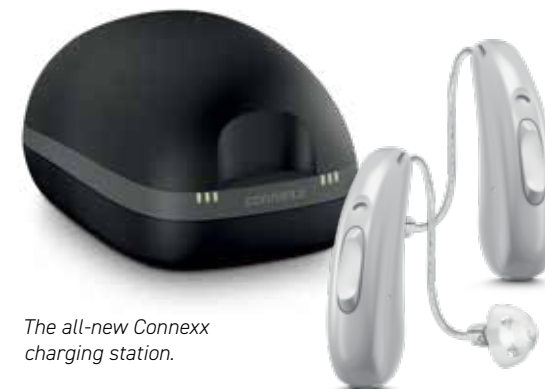
The all-new Connexx charging station.