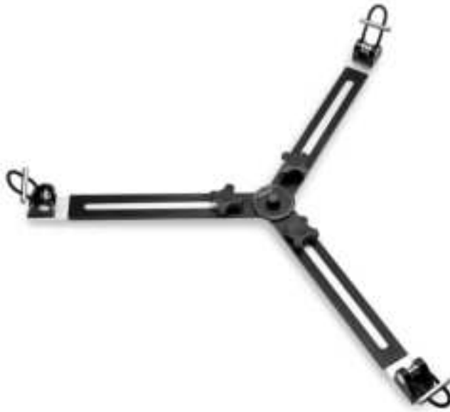
Heavy Duty Aluminum Spreader

Please inspect the contents of your shipped package to ensure you have received everything that is listed below.