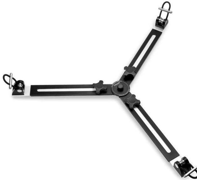
Heavy Duty Aluminum Spreader

Please inspect the contents of your shipped package to ensure you have received everything that is listed below.