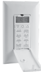
myTouchSmart Sunsmart™ Temporizador digital de pared Modelo n.º 33861

Ajustes, preconfiguraciones y cuenta regresiva personalizados y de fácil programación. Se autorregula para ajustarse a la hora de salida y puesta del sol a lo largo del año. Los interruptores de encendido y apagado se pueden abrir para acceder a los botones del programa.