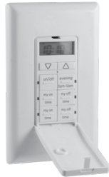
myTouchSmart Temporizador digital de pared Modelo n.º 41431

Ajustes, preconfiguraciones y cuenta regresiva personalizados y de fácil programación. Los interruptores de encendido y apagado se pueden abrir para acceder a los botones del programa.