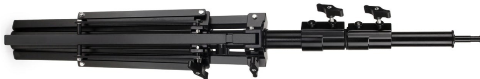
Alpha Docking Universal Support Stand with 5/8" Baby Pin Mount

Please inspect the contents of your shipped package to ensure you have received everything that is listed below.