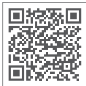
Google Play Store (Android)