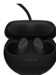
Jabra Connect 5t - Titanium Black