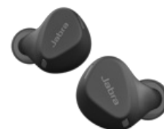
Jabra Elite 3 Active