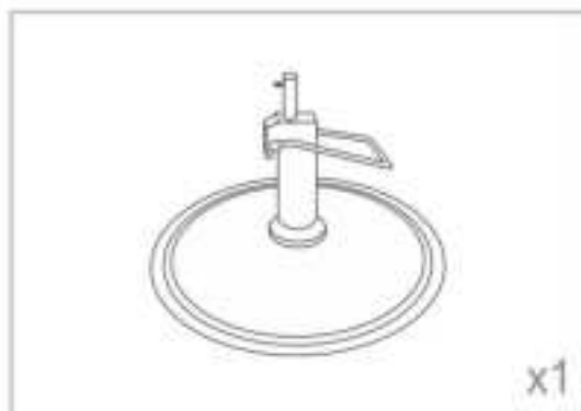
Hydraulic Base and Pump