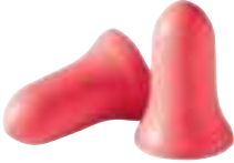
Max ® Highest NRR in disposable

An economical and convenient choice for work situations that demand a high degree of comfort, or where hygiene presents a problem for reuse. Formable foam is also THE material of choice when highest attenuation is required.