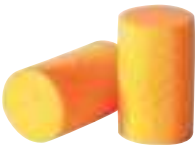
FirmFit ® Firm foam reinvented

NRR 32 XTR-1 XTR-30 CAN A(L) uncorded corded