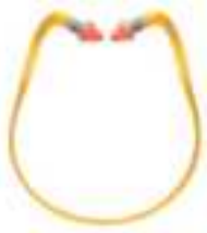
QB2® HYG Supra-aural protection