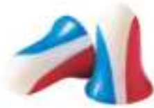
Max ® USA Patriotic red, white, and blue colors

NRR 30 MAX-1S MAX-30S CAN A(L) uncorded corded