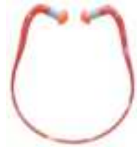
QB3® HYG Semi-aural protection