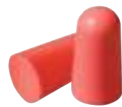
X-TREME ® Tapered design for comfort

NRR 32 LL-1 LL-30 CAN A(L) uncorded corded