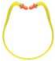
QB1® HYG Inner-aural protection

An alternative for those who work in intermittent noise or for managers and visitors who move in and out of noisy areas.