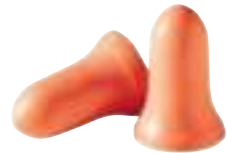
Max Small ® Comfort for smaller ear canals

NRR 30 LPF-1 LPF-30 CAN A(L) uncorded corded