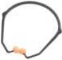
PerCap® Folding semi-aural protection