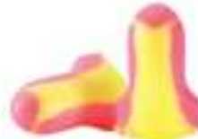
Laser Lite ® Highly visible protection

NRR 33 MAX1-USA MAX30-USA CAN A(L) uncorded corded