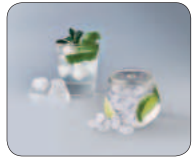
Dual Ice Maker with Ice Bites