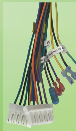
Direct Connect Harness