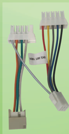
Ensight ® Adapter