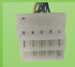
Factory Harness Connector